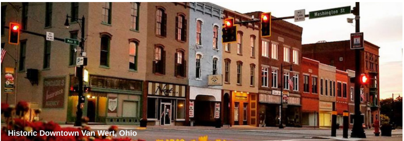
Historic Downtown Van Wert, Ohio

Each county also administers a County Subcommittee that discusses county-specific transportation priorities, needs, and desires. This committee can consist of a variety of transportation and economic development professionals, county, municipal, and township representatives, and include representatives for all modes of transportation including bicycle/pedestrian, and transit.