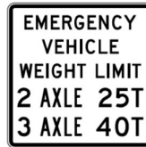
Emergency Vehicle (EV) Example