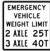
Emergency Vehicle (EV) Example