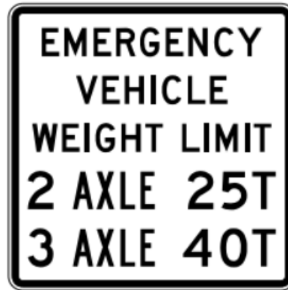
Emergency Vehicle (EV) Example